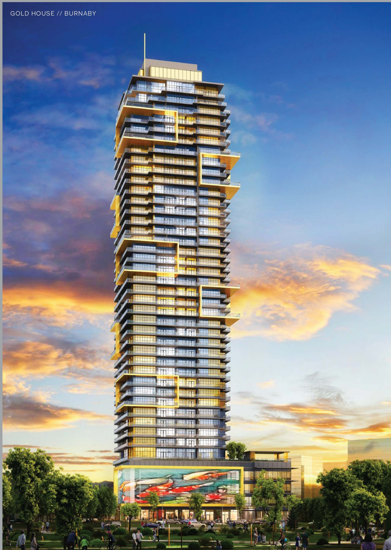
GOLD HOUSE // BURNABY